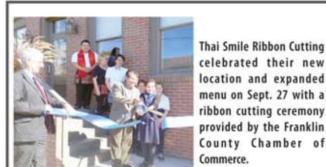
Thai Smile Ribbon Cutting celebrated their new location and expanded menu on Sept. 27 with a ribbon cutting ceremony provided by the Franklin County Chamber of Commerce.