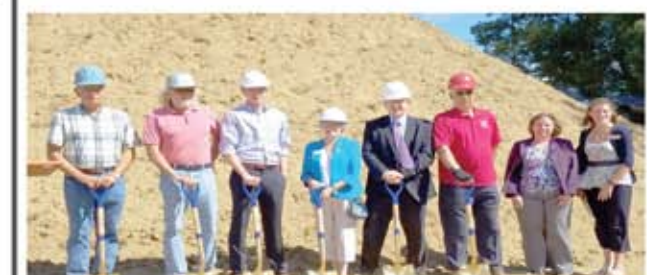
A groundbreaking ceremony marked the beginning of construction of Woodlands Memory Care of Farmington on Sept. 9.