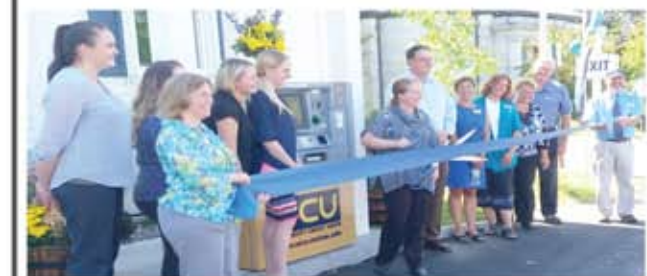
On Sept. 7, members of the Franklin County Chamber of Commerce joined the University Credit Union's Grand Re-Opening with a ribbon cutting ceremony.