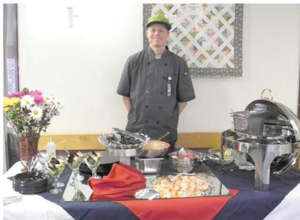
Sampling of the delicious food at the May BAH included mussels and shrimp