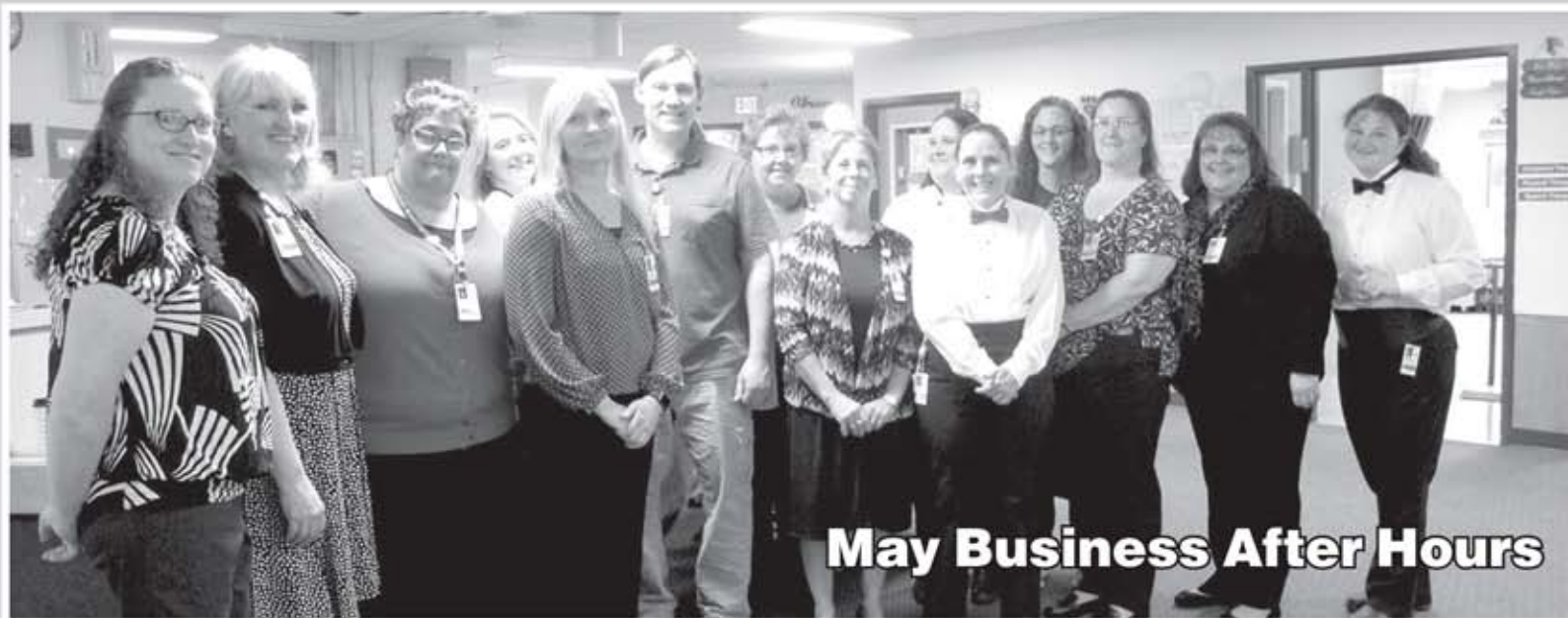
Host of the Franklin County Chamber May Business After Hours was Sandy River Center in Farmington

For more information or to take the Welcome ME training, visit: www.umaine.edu/centro/welcome-me-quality-service-training-home