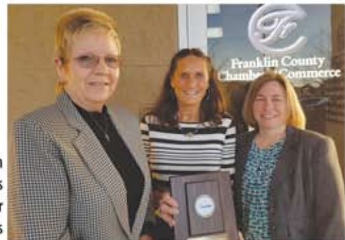
Medium Business of the Year nominees