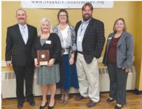
Group, Nonprofit or Civic Organization of the Year nominees