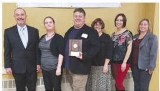
Large Business of the Year nominees