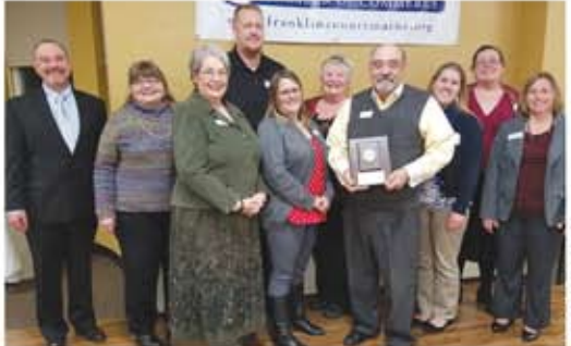
Small Business of the Year nominees

The Franklin County Chamber of Commerce would like to thank our generous partners who made this evening possible. Our Gold Partners for the annual dinner are Franklin Savings Bank, Senior Planning Center, and Complete Dentistry. The Silver Partners of this event include Wilson Lake Inn, the Dead River Company, Seniors Plus, Skowhegan Savings Bank, United Insurance Shiretown Agency, and Comfort Inn and Suites. We thank you for your loyal support of the Franklin County Chamber.